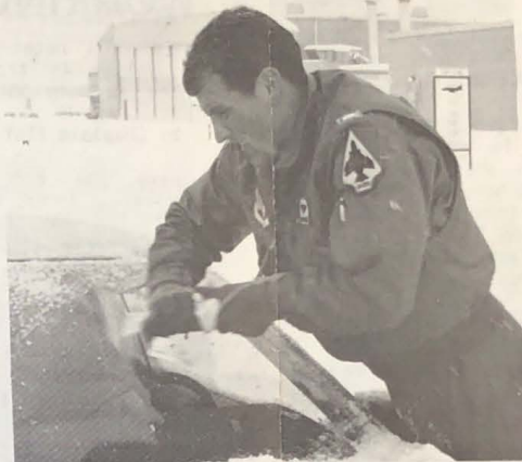
THOSE PERSONS WHO RETURNED AT THE MID POINT OF THE HAWAII DEPLOYMENT WERE GIVEN AMPLE OPPORTUNITY TO PARTICIPATE IN THE LOCAL WINTER ACTIVITIES SUCH AS SLIPPING, SLIDING, SCRAPING AND SHIVERING.