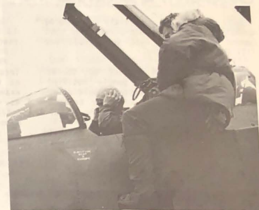
HAWAII BOUND AIRCRAFT BEING LAUNCHED BY GROUND CREW MEMBERS IN PARKAS AND RECOVERED AT BARBERS POINT IN T-SHIRTS.