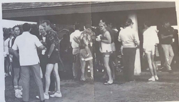
EVEN THOUGH HARD WORK WAS THE ORDER OF THE DAY, THERE WAS SOME TIME SET ASIDE FOR RELAXATION IN HAWAII.